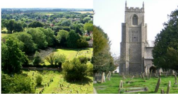
St Mary's, North Elmham – as part of Open Churches Week